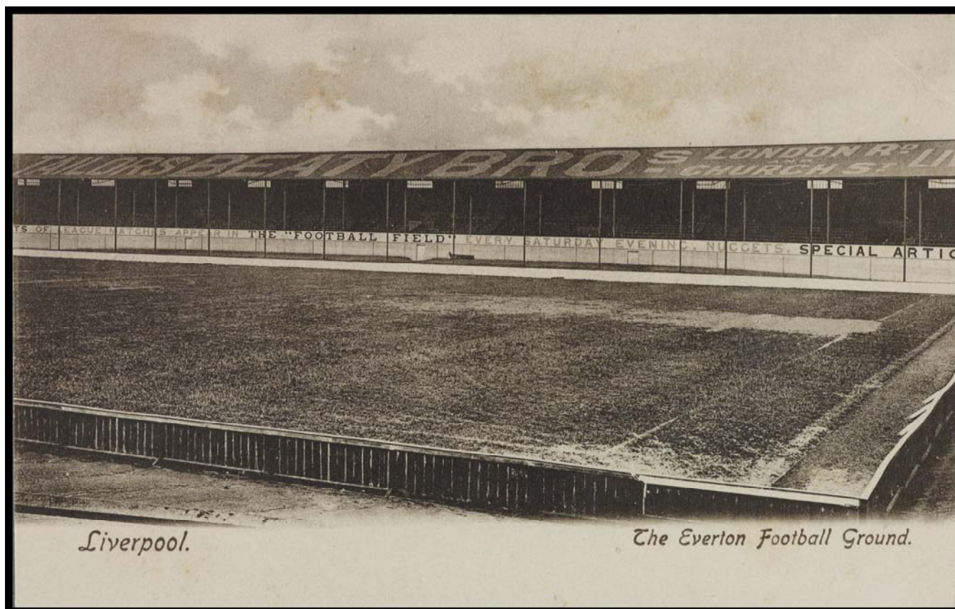
Goodison Park, c.1900, 796EFC29-3-1

Carry out the same activity using this image. Encourage pupils to discuss how the two settings and atmosphere might be described differently.