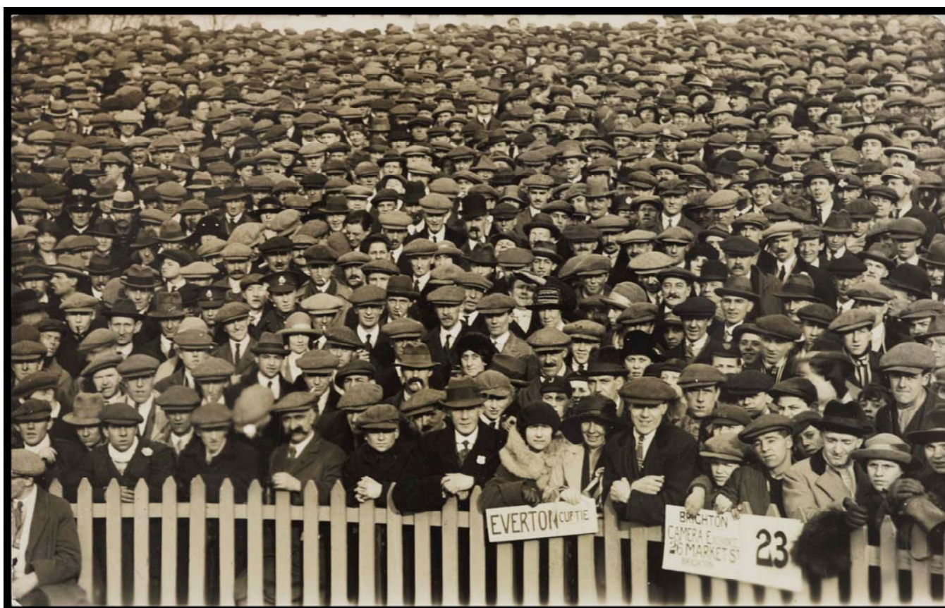
Everton F.C. fans as a football match in 1913. 796EFC29-4-7