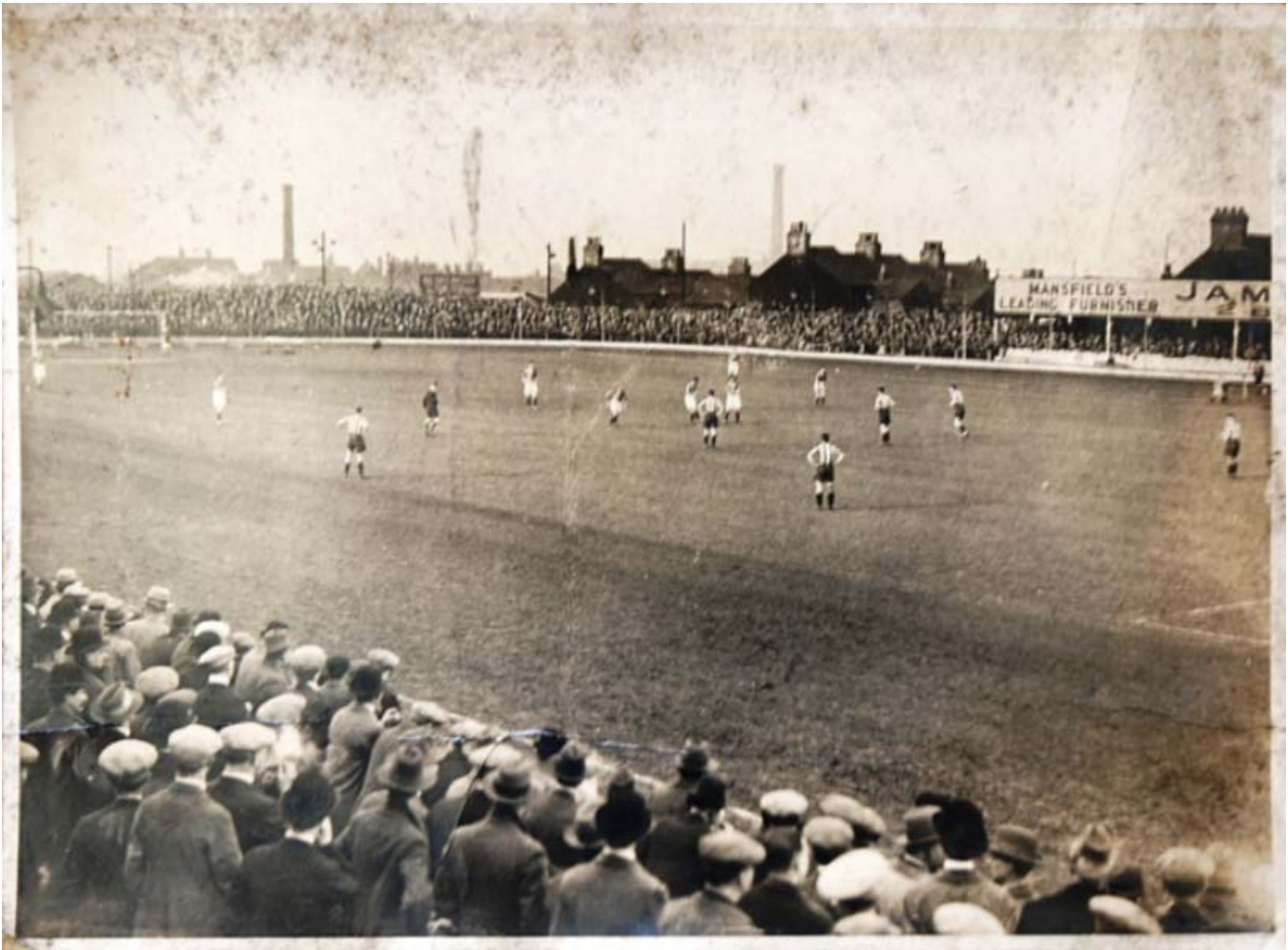
Goodison Park, c.1920s

Where would a story about football take place?